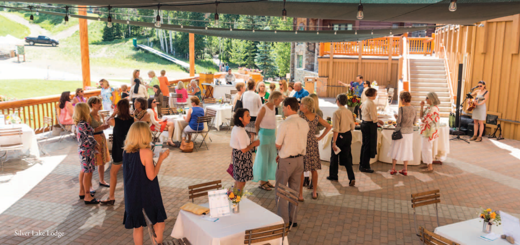
Silver Lake Lodge