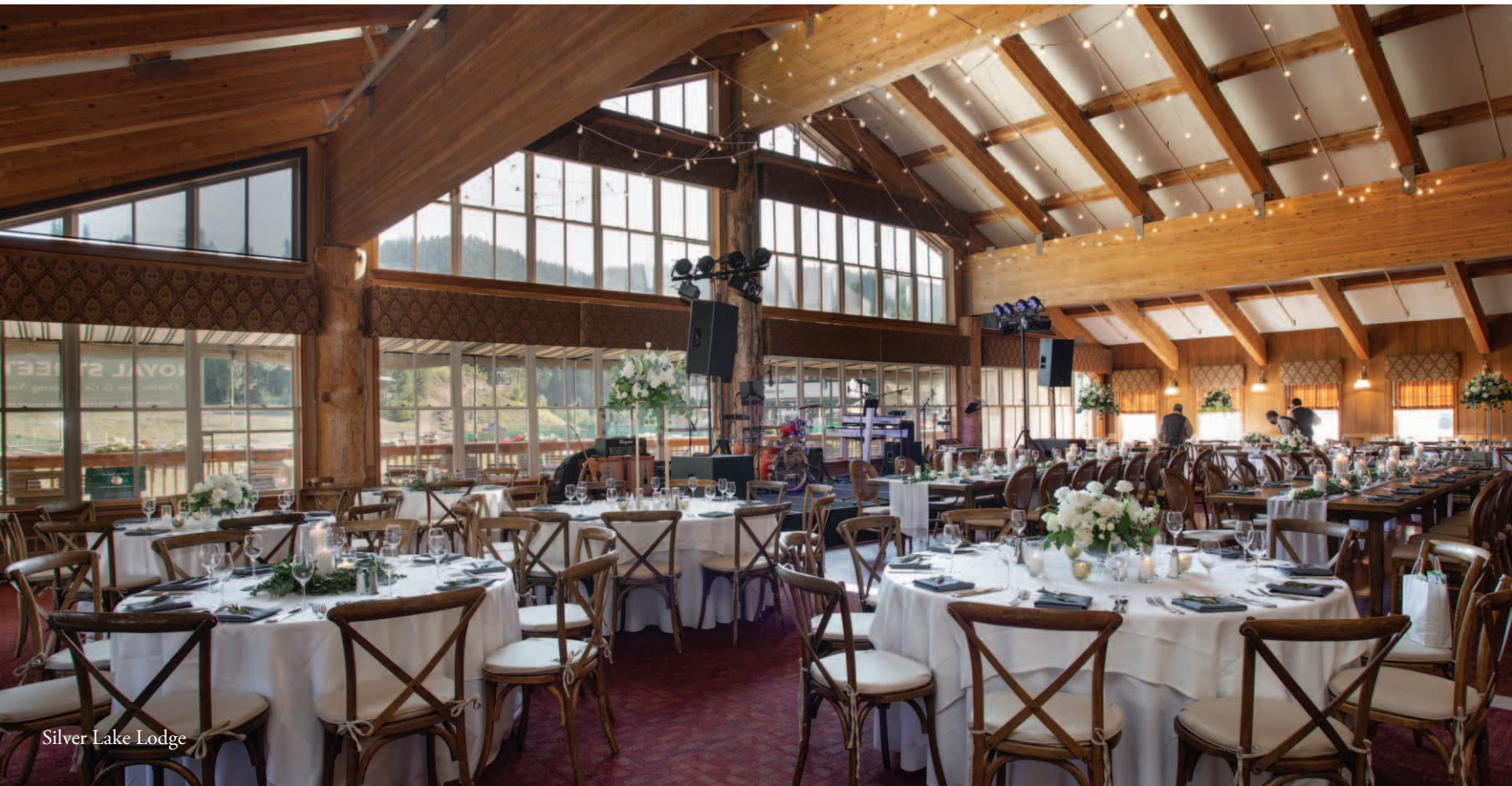
Silver Lake Lodge