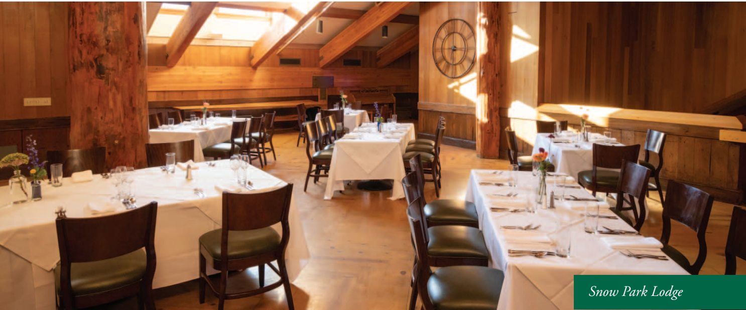
Snow Park Lodge