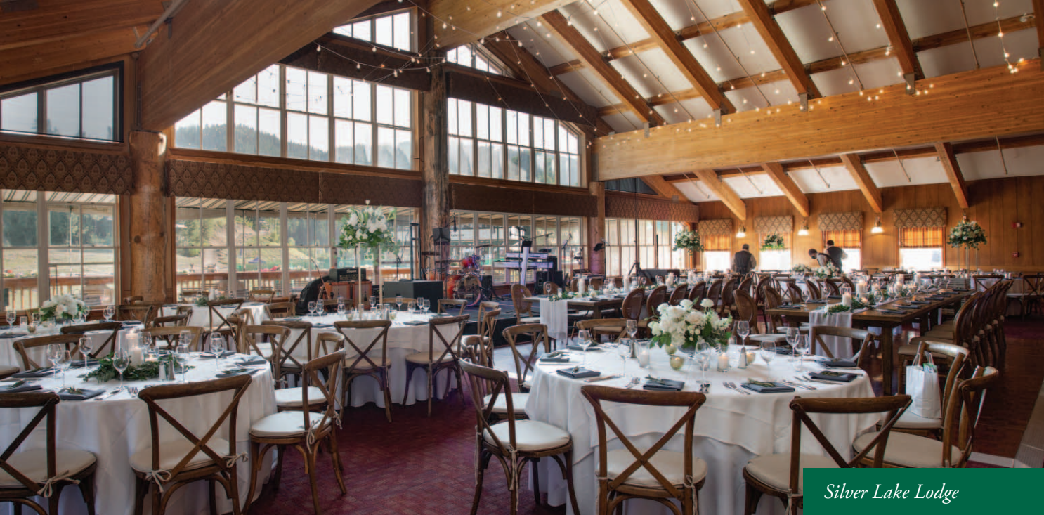
Silver Lake Lodge