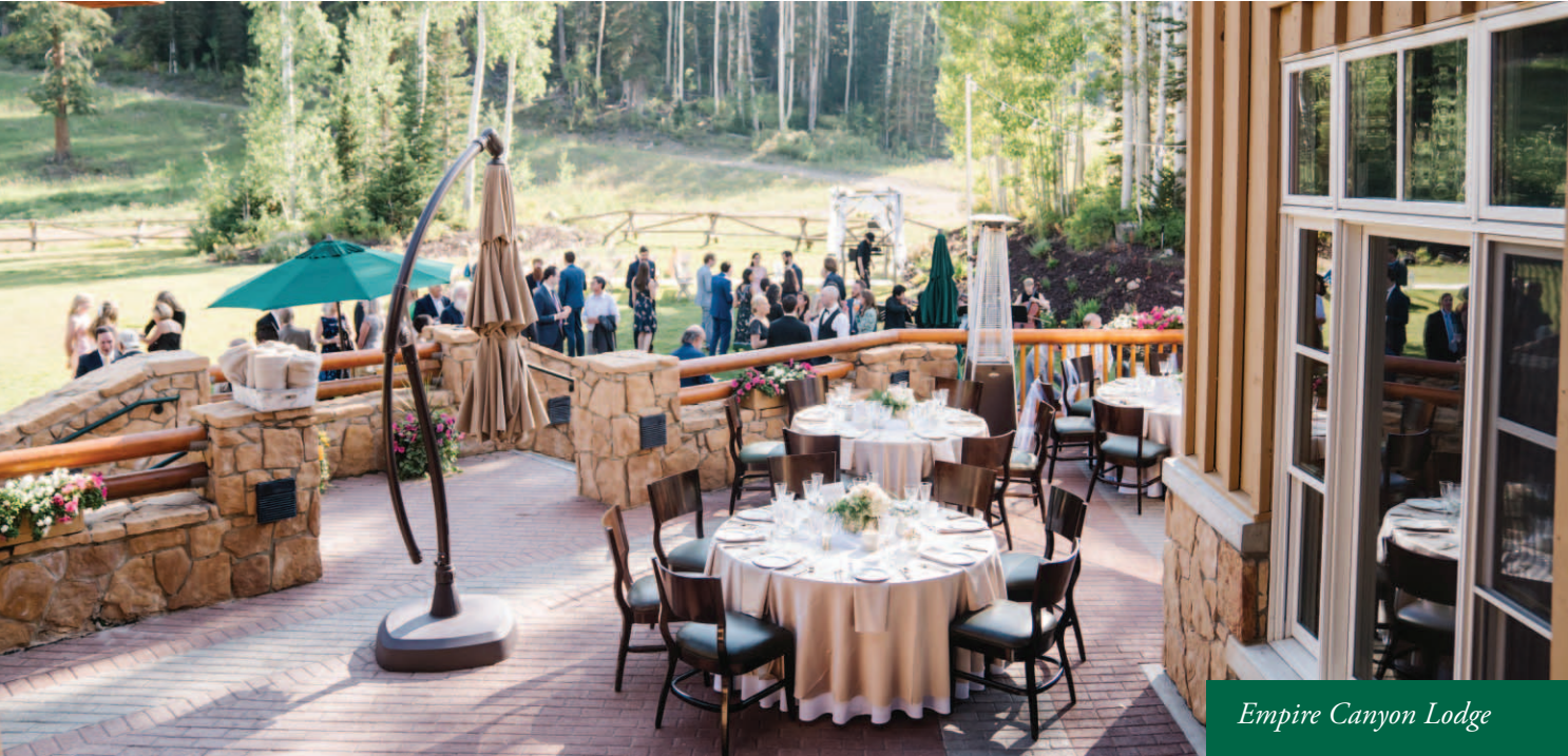
Empire Canyon Lodge